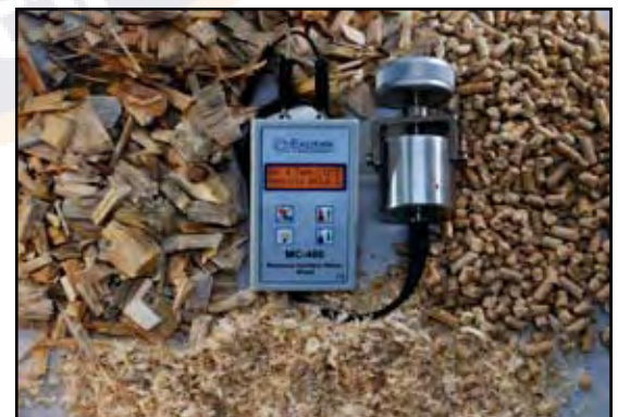
MC-460 with Compression Cup for Wood Chips, Pellet and Sawdust