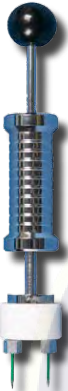
S-30 Sliding Hammer Probe for Sawn Timber and Wood