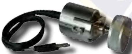
S-40 Compression cup for Wood Chips, BioFuels Pellets and Sawdust